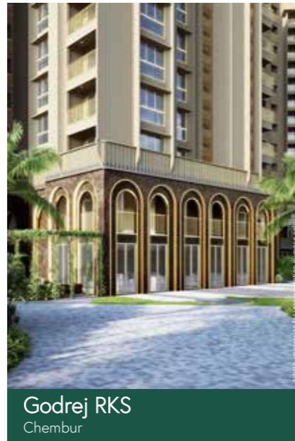
Godrej RKS Chembur