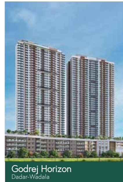
Godrej Horizon Dadar-Wadala