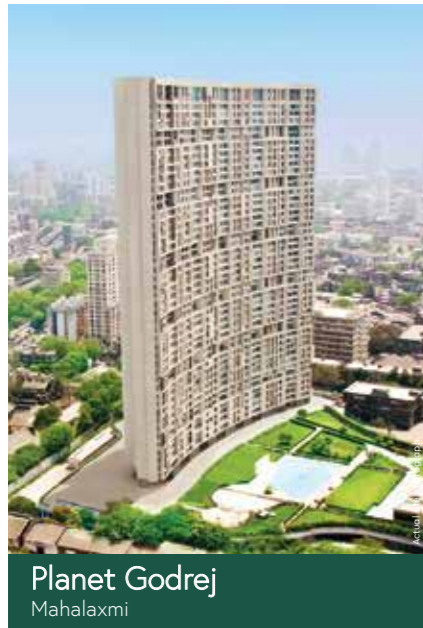
Planet Godrej Mahalaxmi

Bringing Godrej Group's 127-year legacy of innovation to real estate, we blend trust, advanced design and technology in every development. Our focus on sustainability, thoughtful design and uncompromising quality, aims to redefine residential landscapes across various micro-markets.