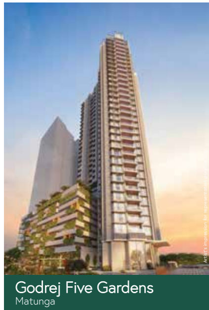
Godrej Five Gardens Matunga