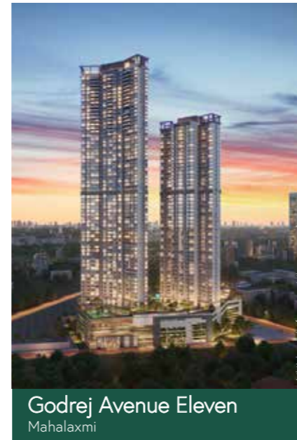
Godrej Avenue Eleven Mahalaxmi