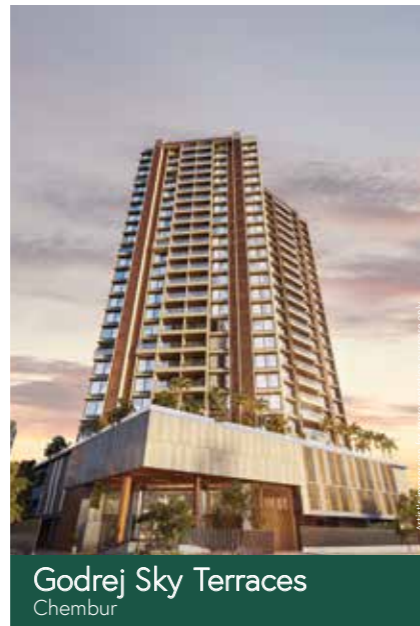
Godrej Sky Terraces Chembur