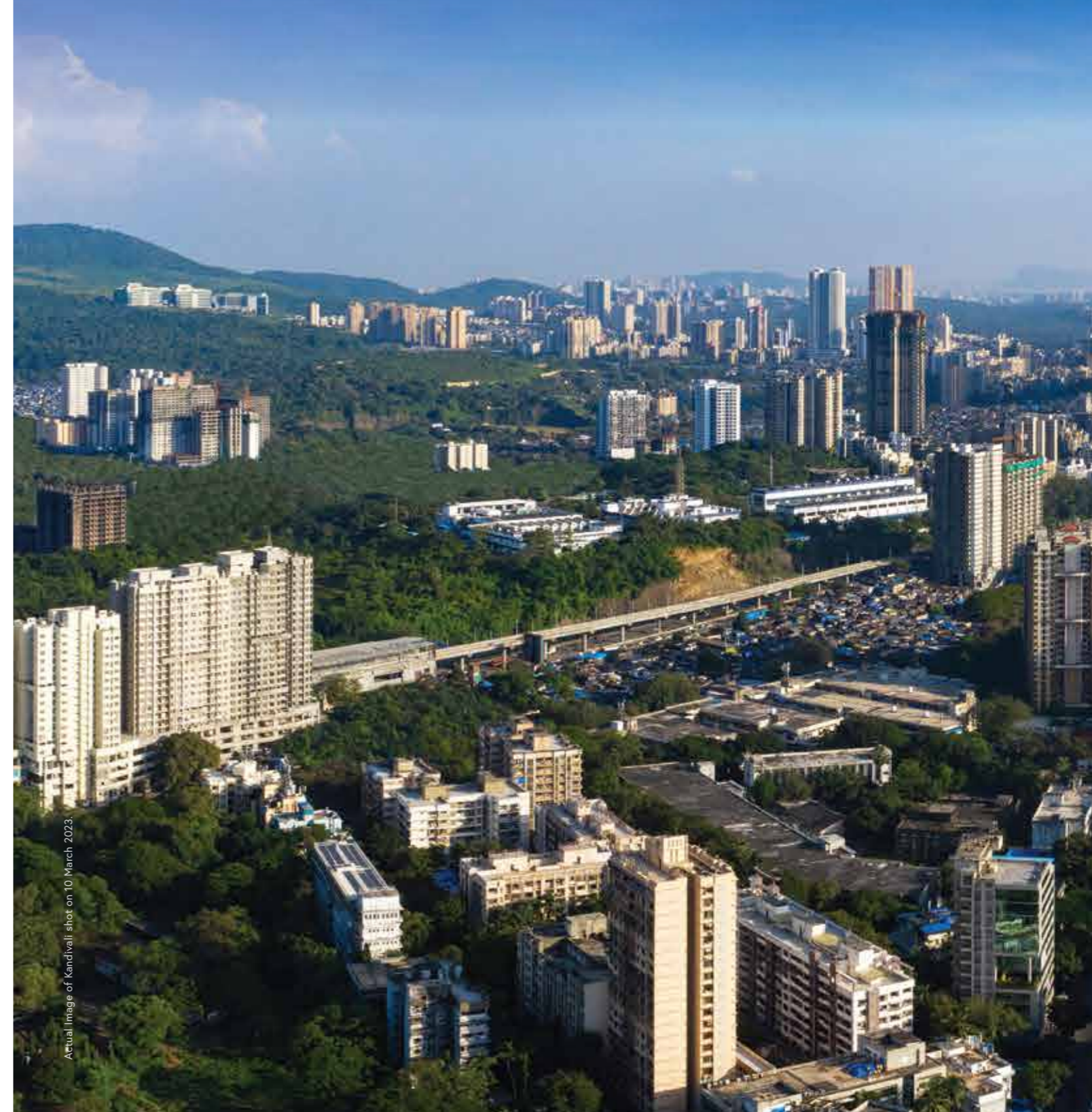
Actual image of Kandivali shot on 10 March 2023.

Kandivali East stands out as an urban neighbourhood, seamlessly connected with robust social amenities and a thriving community, making it the ideal choice for long-term living. Kandivali consistently benefits from government initiatives aimed at enhancing its infrastructure.